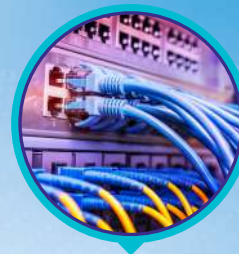
Fiber & Copper Cabling Products