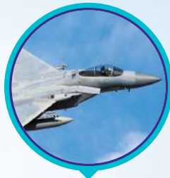
Wiring Harness for Aerospace & Defence