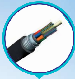
Optical Fiber Cables