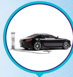
Wiring Harness for Automotive & Industrial